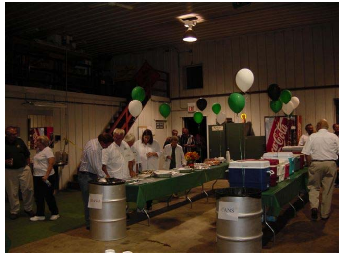
Catering by Orlando's was a popular hit during the afternoon.