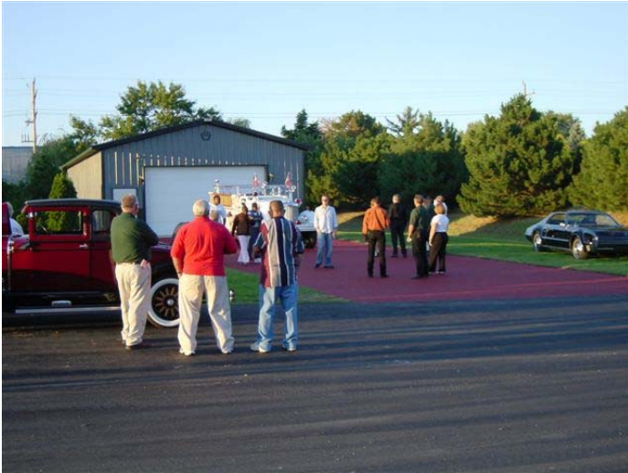
Classic cars and an antique fire truck owned by employees were also on display.